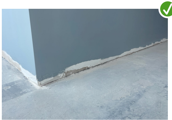
Drywall. Smooth and even. No gaps larger than 1/2".

Integral Cove is a hand-built base that integrates the floor and the wall to create a seamless 'bathtub' effect. To deliver BEST WORK for the project, we need a smooth, sound, and solid substrate.