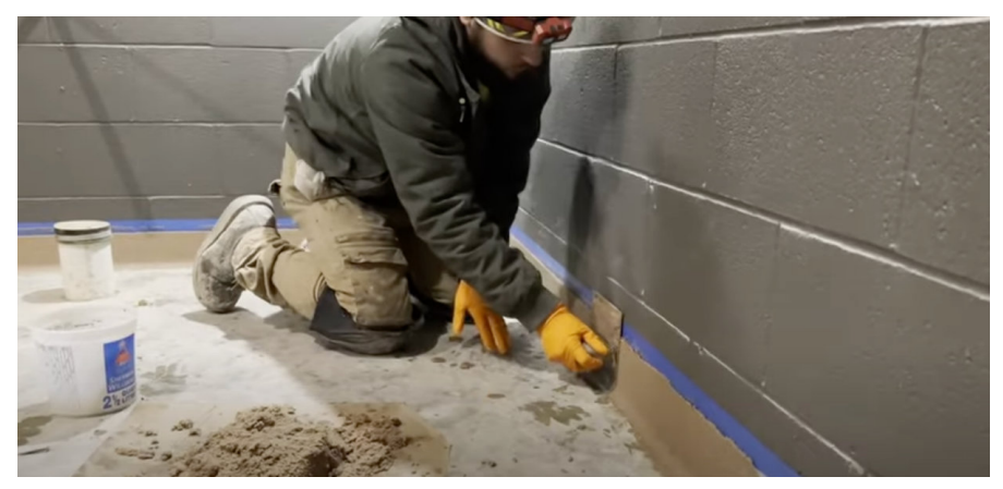
The Hand-Built Cove Process