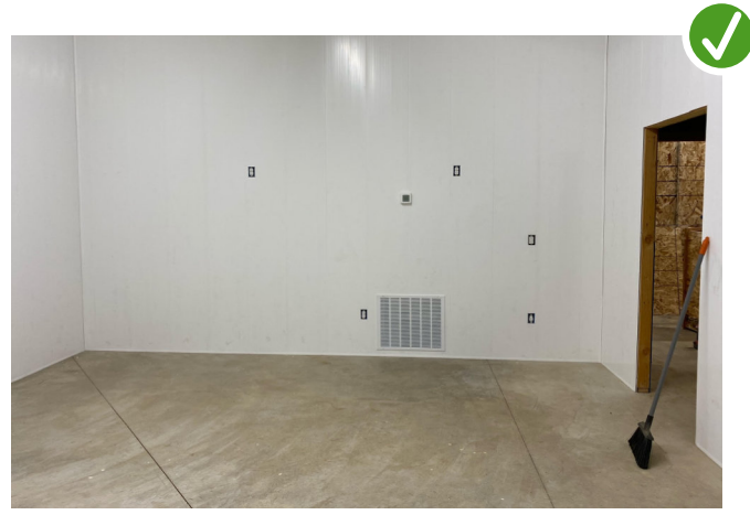
FRP Panels. Installed to the bottom of drywall. Flat and secured, not wavy, cracked, or uneven.